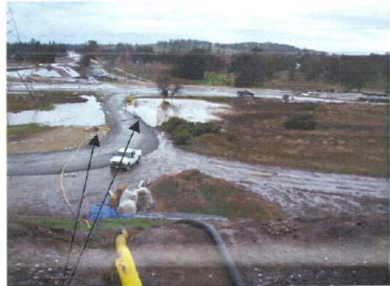
Figure 2: Area where pumping was taking place Note: two pumps were operational at the time of the site inspection