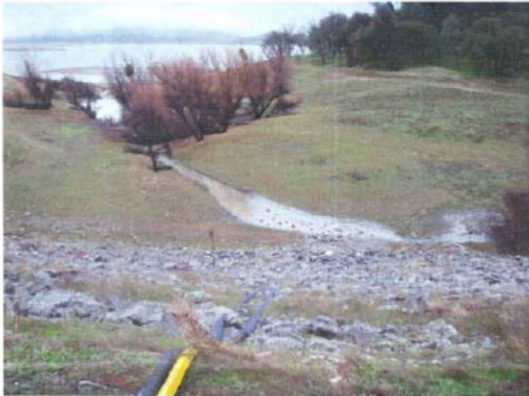
Figure 1: Sediment laden storm water from the project flowing into Folsom Lake due to pumping